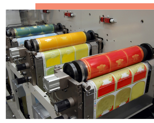
Inks for Flexographic Printing

Jaylink can be easily incorporated into a formula by dispersing it in a monomer that has strong solvency. Up to 30% of this additive can be dissolved in most acetate and ketone solvents. Jaylink is also soluble in acrylate monomers such as IBOA, NNDMA, NVP, EOEOEA, TMPTA, GPTA, PONPGDA, HDDA and TPGDA.